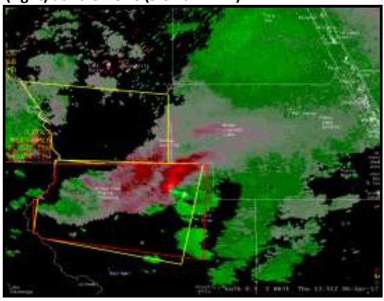
KMLB 0.5 degree reflectivity (left) and storm relative motion (right) at 14:02 UTC (10:02 am EDT):