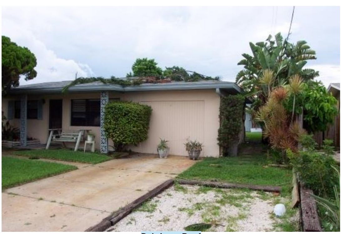
Debris on Roof