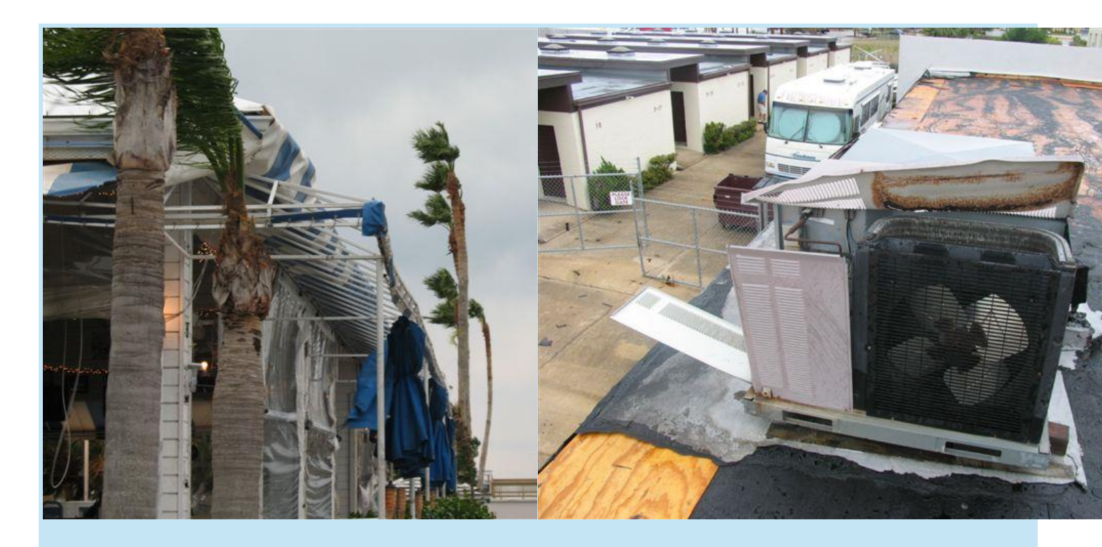
North Merritt Island