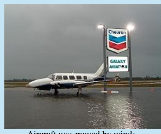
Aircraft was moved by winds.