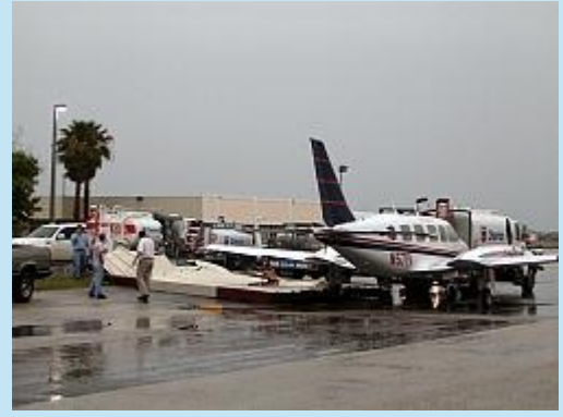
Hangar door blown out.