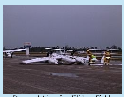
Damaged Aircraft at Witham Field.