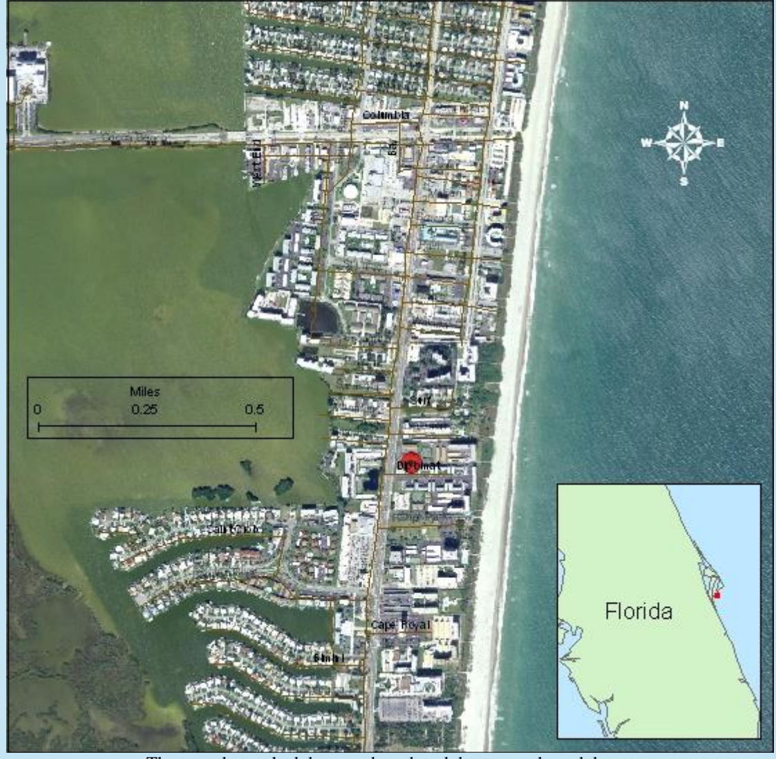
The tornado touched down and produced damage at the red dot, at 3100 N. A1A in Cocoa Beach

The storm was the result of a lifting warm front which brought a rapid increase to surface dew points, as well as southerly low-level winds, to promote rotating updrafts within erupting thunderstorms. The tornado potential was accentuated given the storm's proximity to the coast.