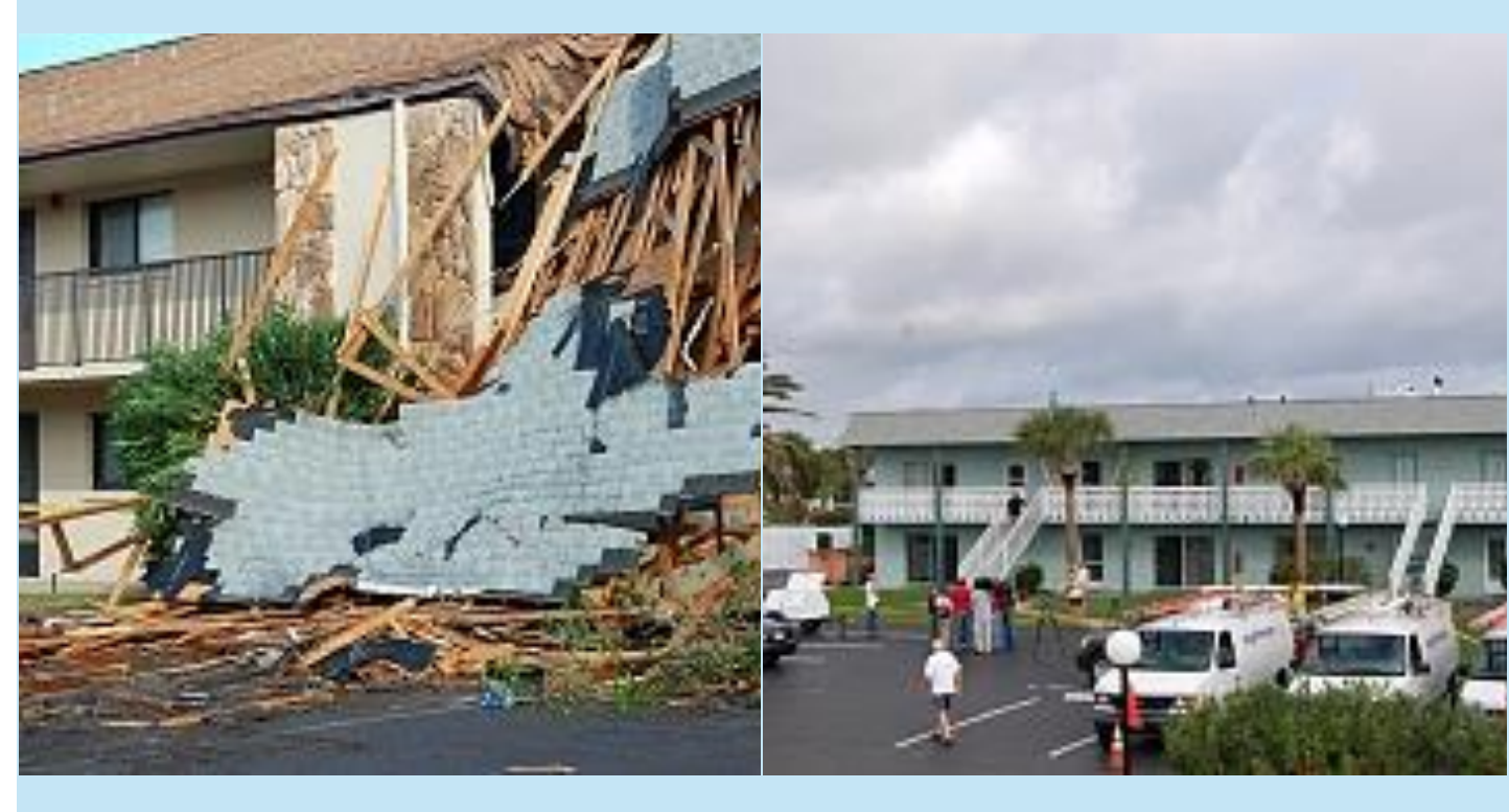
Part of the roof from Diplomat Condo where it landed on nearby Windrush Condo