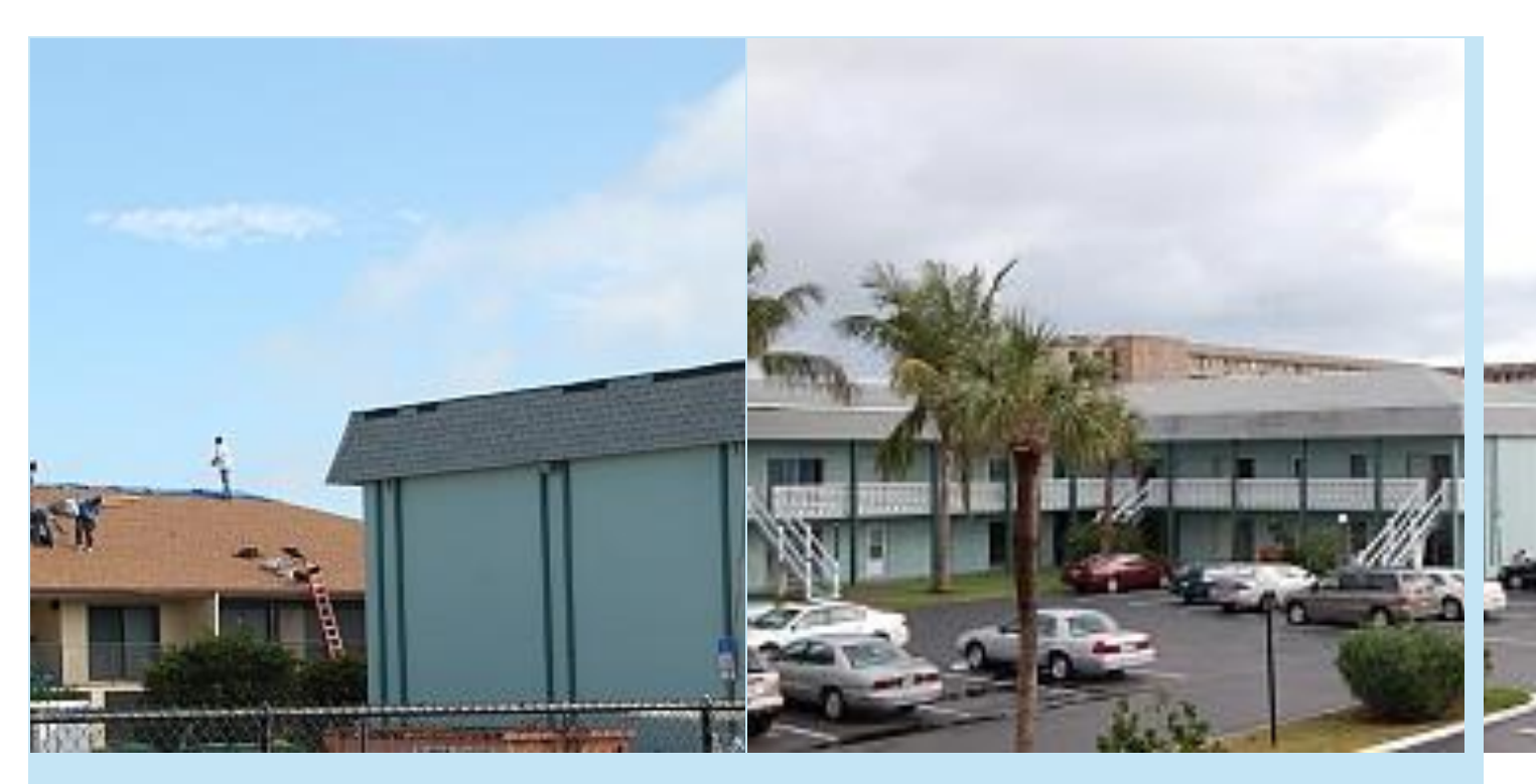
Illustrating the proximity of Diplomat Condo to Windrush Condo. The roof from building in foreground hit the building behind it.