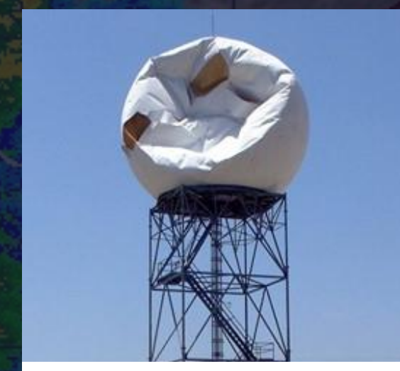
Damage to the KDFX (Bracketville, TX) Radar Dome in May 2001

One final note about the third step in the SLEP process is the fact that while the early 2020 project was the first time the dome had been removed from the KEWX radar (pictured earlier) since it was installed, February 2020 marked the second time the dome had been removed from KDFX, the Laughlin Air Force Base WSR-88D located in Brackettville (near Del Rio). On May 25, 2001 baseball-sized hail and winds of 80 to 100 mph combined to damage the dome of the KDFX radar (pictured left). Although there was minimal damage to the radar dish and pedestal inside the dome, the damaged dome itself was removed and a new one was assembled around the radar dish.